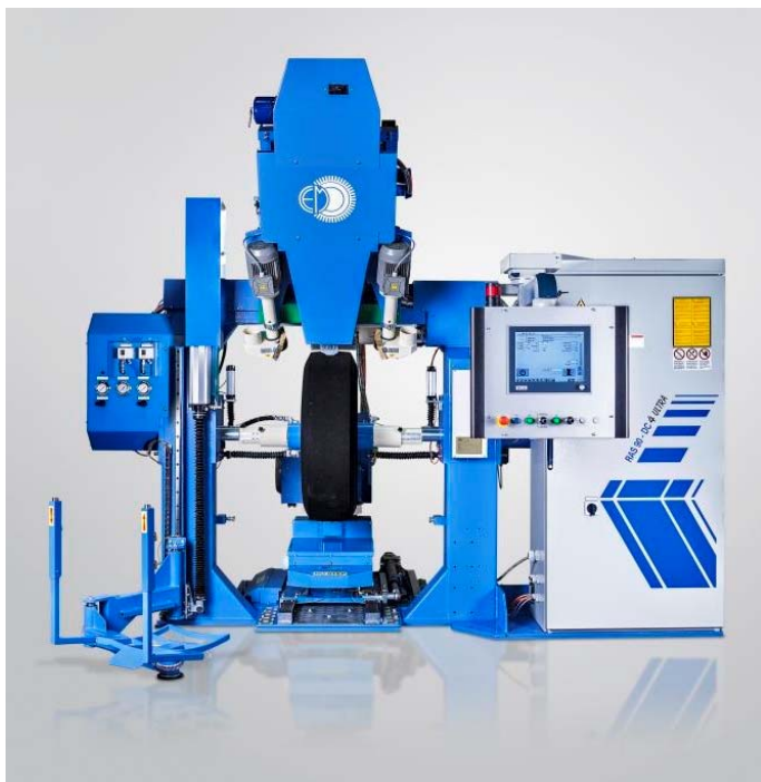
machine complete with computer controlled sidewall brushing assembly and articulated buffing/brushing arm

MACHINE SUITABLE FOR TRUCK TYRES UP TO 445 R 22.5" AND 495/45 R 22.5"